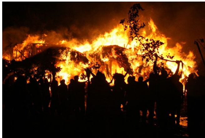
The burning Tombs