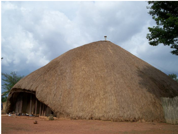
The Kasubi Tombs

Plans to rebuild the tombs are already existing.