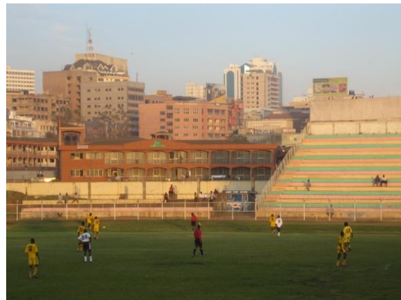
The Nakivubo Stadium

equipped we entered. Inside you were expected by artists performing on the stage and many food sellers, offering everything from gonja to chapatti, from biscuits to meat. Unfortunately the announced two giant screens were not as big as expected. At kick-off the sun was standing high what meant that you could hardly see the ball. But at least you could feel the atmosphere. The Vuvuzelas were blown and after the first goal on African ground the whole stadium went crazy for a minute. After the 1-1 it turned out, that even in Uganda there are some supporters of the Mexican team (or at least opponents of the South African). By this time the sun was setting down, what meant that you could now even see the ball. But within this period nothing interesting happened anymore. The referee blew the whis-