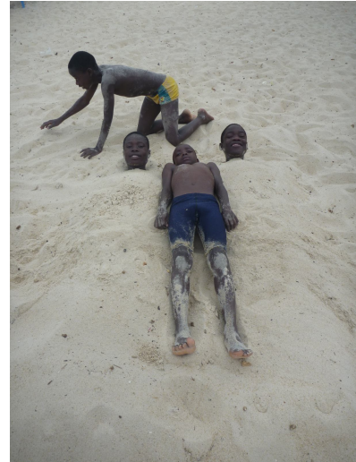
Rainbow kids having fun at the beach