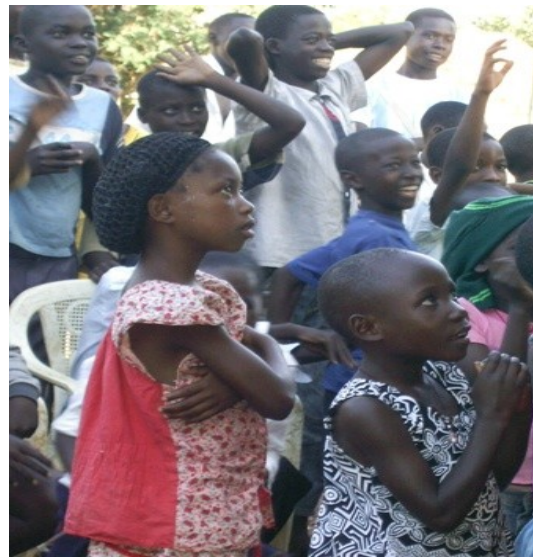
Above: Both girls and boys need equal opportunity to express themselves when their interests are threatened

Secondly, children should be encouraged to talk about their experiences and in this way find relief and support. This serves not only to make adults understand the children's plight better as they witness the psychological damage abuse does to children, but also to open the door to holding offenders accountable for their actions.